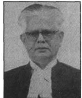
Hon'ble Mr. Justice J.C. Shah 17-12-1970 to 21-1-1971