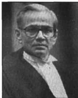
Hon'ble Mr. Justice V.N. Khare 19-12-2002 to 1-5-2004