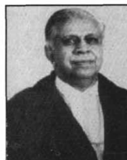
Hon'ble Mr. Justice M.N. Venkatachaliah 12-2-1993 to 24-10-1994