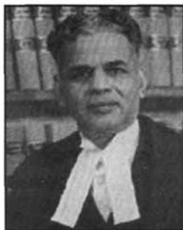
Hon'ble Mr. Justice E.S. Venkataramaiah 19-6-1989 to 17-12-1989