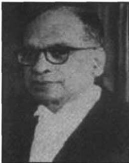
Hon'ble Mr. Justice K. Subba Rao 30-6-1966 to 11-4-1967