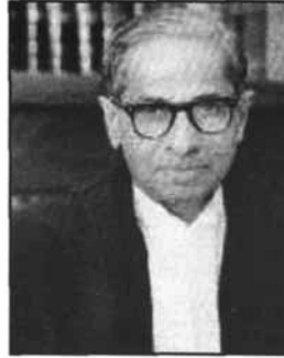
Hon'ble Mr. Justice P.B. Gajendragadkar 1-2-1964 to 15-3-1966