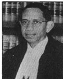
Hon'ble Mr. Justice R.C. Lahoti 1-6-2004 to 31-10-2005