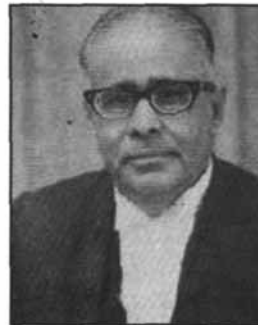
Hon'ble Mr. Justice M. Hidayatullah 25-2-1968 to 16-12-1970