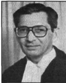
Hon'ble Mr. Justice S.P. Bharucha 1-11-2001 to 5-5-2002