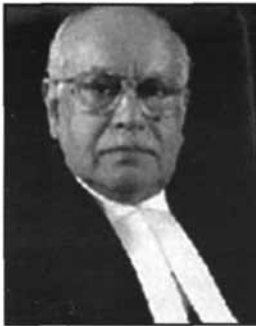
Hon'ble Dr. Justice A.S. Anand 10-10-1998 to 31-10-2001