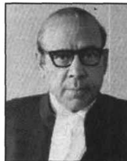
Hon'ble Mr. Justice M.H. Beg 29-1-1977 to 21-2-1978