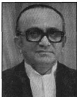
Hon'ble Mr. Justice P.N. Bhagwati 12-7-1985 to 20-12-1986