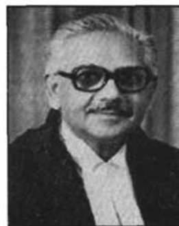
Hon'ble Mr. Justice J.S. Verma 25-3-1997 to 18-1-1998