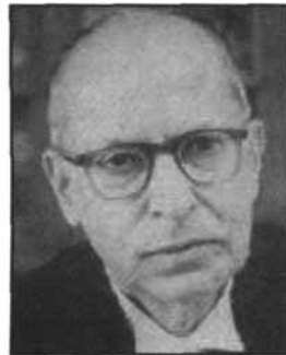
Hon'ble Mr. Justice K.N. Wanchoo 12-4-1967 to 24-2-1968