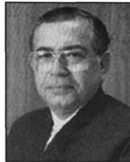
Hon'ble Mr. Justice B.N. Kirpal 6-5-2002 to 7-11-2002