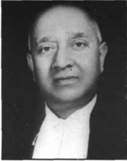
Hon'ble Mr. Justice S.R. Das 27-12-1956 to 30-9-1959