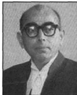
Hon'ble Mr. Justice A.N. Ray 26-4-1973 to 28-1-1977