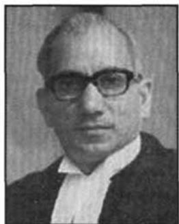
Hon'ble Mr. Justice R.S. Pathak 21-12-1986 to 18-6-1989