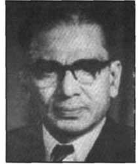
Hon'ble Mr. Justice A.K. Sarkar 16-3-1966 to 29-6-1966