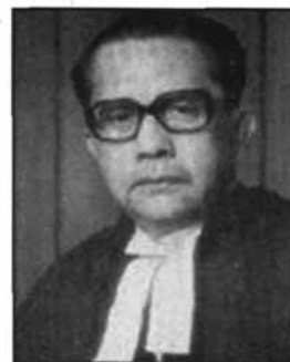
Hon'ble Mr. Justice S. Mukharji 18-12-1989 to 25-9-1990