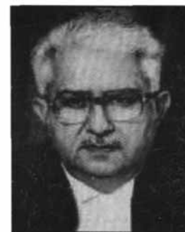
Hon'ble Mr. Justice M.M. Punchhi 19-1-1998 to 9-10-1998