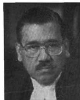
Hon'ble Mr. Justice A.M. Ahmadi 25-10-1994 to 24-3-1997