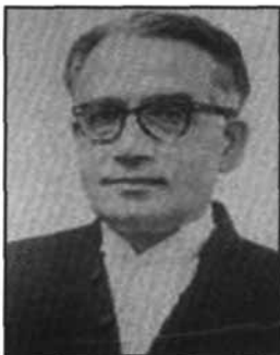
Hon'ble Mr. Justice S.M. Sikri 22-1-1971 to 25-4-1973