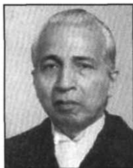
Hon'ble Mr. Justice Ranganath Misra 26-9-1990 to 24-11-1991