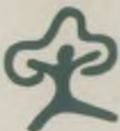
Ministry of Environment and Forests Govt. of India